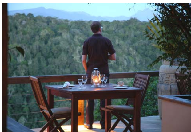
Hog Hollow Country Lodge, Tsitsikamma National Park, South Africa.

Visit our website for more information or get in touch and let us help you give your travel direction.