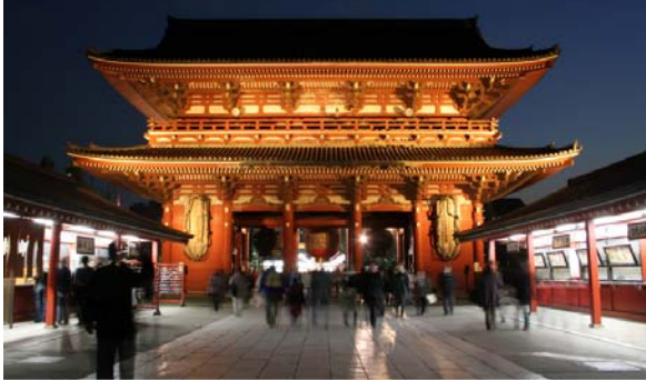
Asakusa Sensoji Temple, Tokyo