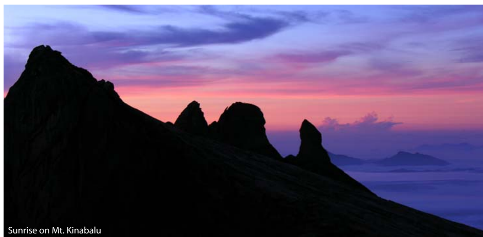
Sunrise on Mt. Kinabalu