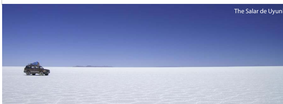
The Salar de Uyuni

All this, combined with excellent project possibilities and the ability to link easily to the wonders of southern Peru or northern Chile mean that Bolivia is an ideal destination for a school looking for a challenging adventure. Contact us to discuss your requirements in detail.